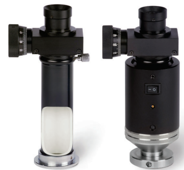
20X Brinell Microscope and 20X Brinell Microscope with LED